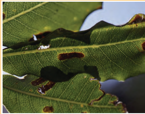
The brown scars left by the egg masses on the underside of the leaf are easier to see after the nymphs emerge from the eggs. A leaf may have more than one egg mass.

Download a copy of this brochure from http://gwss.ucanr.org