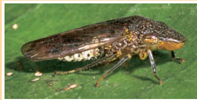
The glassy-winged sharpshooter gets its name from its transparent wings.

scapes, native woodlands and riparian vegetation. It feeds on hundreds of plant species including woody plants and annual and perennial herbaceous plants. It occurs in high numbers on citrus. Common landscape host plants include bird of paradise, eucalyptus, euonymus, crape myrtle, pittosporum, sunflower, hibiscus, xylocma and cottonwood, among many others. On most plants, it feeds on stems rather than leaves. When feeding, it excretes copious amounts of watery excrement in a steady stream of small droplets. In urban