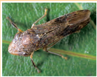
Glassy-winged sharpshooters are large insects, about 1/2 inch long.

Xylella fastidiosa , the bacterium that causes Pierce's disease. Pierce's disease kills grapevines, and there are no effective treatments for it. Glassy-winged sharpshooters led to a Pierce's disease epidemic in the Temecula region of Southern California that continues to threaten the survival of its viticultural industry.