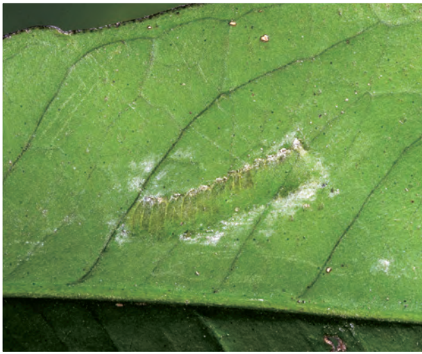
Glassy-winged sharpshooter eggs are laid together on the underside of leaves, usually in groups of 10 to 12. The egg masses appear as small, greenish blisters. These blisters are easier to observe after the eggs hatch, when they appear as tan to brown scars on the leaves.