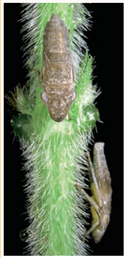
The immature nymphs are wingless.

Native to the southeast United States, this insect was first observed in California in 1990 and is now established in Kern, Los Angeles, Orange, Riverside, San Bernardino, San Diego and Ventura Counties and has been sporadically found in a few cities of Northern California. It is a particular threat to California vineyards due to its ability to spread