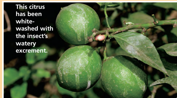
This citrus has been white-washed with the insect's watery excrement.

The adult glassy-winged sharpshooter is a large insect, almost 1/2 inch (12 mm) long, and is dark brown to black with a lighter underside. The upper parts of the head and back are stippled with ivory or yellowish spots and the wings are partly transparent with reddish veins. Adult females may have large white spots on their upper wings. This white substance, secreted by the female, is used to cover freshly laid egg masses. The nymphs are wingless, mottled olive gray in color and are variable in size, depending on their stage.