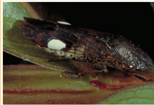
Female with white secretion on the wings that she later uses to cover the newly laid egg masses.

This informational brochure was produced by ANR Communication Services for the University of California Pierce's Disease Research and Emergency Response Task Force. You may download a copy and find additional resources from the University of California Glassy-winged Sharpshooter Workgroup Web site at http://gwss.ucanr.org .