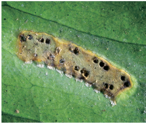
Parasitized egg masses are tan to brown in color with small, circular holes at one end of the eggs.