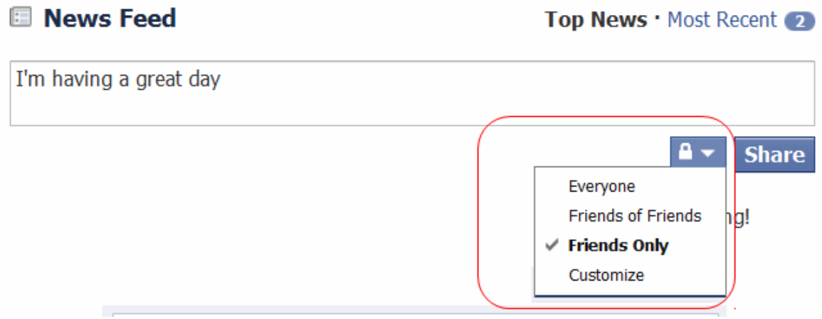
You can control who can see each individual post, photo or video.

For example, if you're updating your News Feed status, you first type in what you want to say, then – before you click the Share link – click the little lock to the left of Share, and you will see the familiar drop-down box that lets you decide who can see that particular piece of content. As of this writing, Facebook was experimenting with ways to make this feature a bit easier to find, so what you see may be a bit different from the following screen shot.