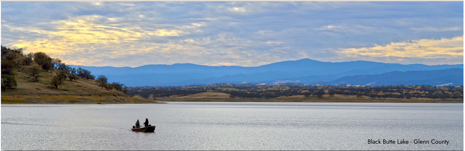
Black Butte Lake - Glenn County

PRESENTED BY: THE BUTTE-GLENN EMERGENCY PREPAREDNESS HEALTHCARE COALITION