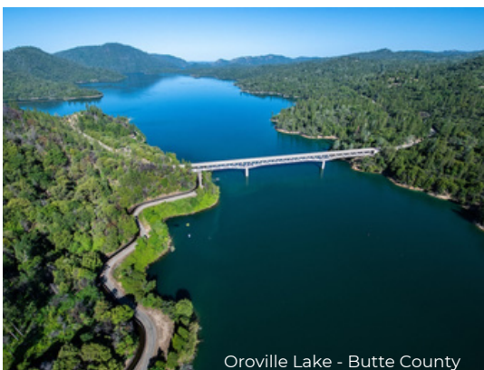
Oroville Lake - Butte County