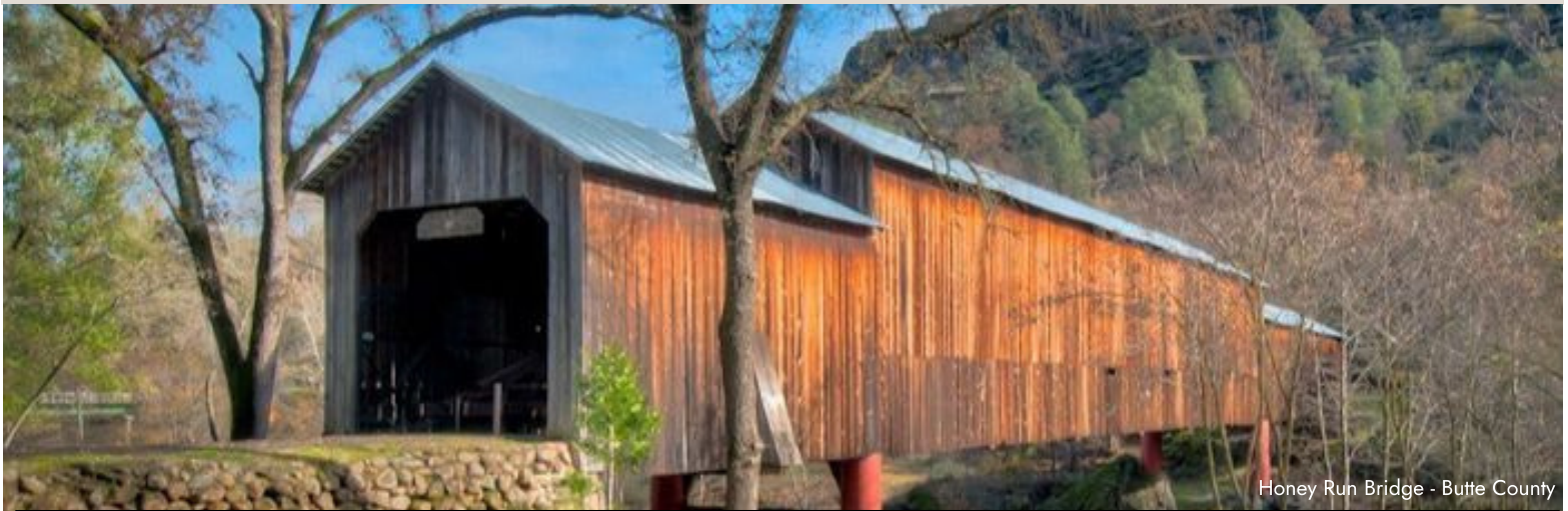
Honey Run Bridge - Butte County