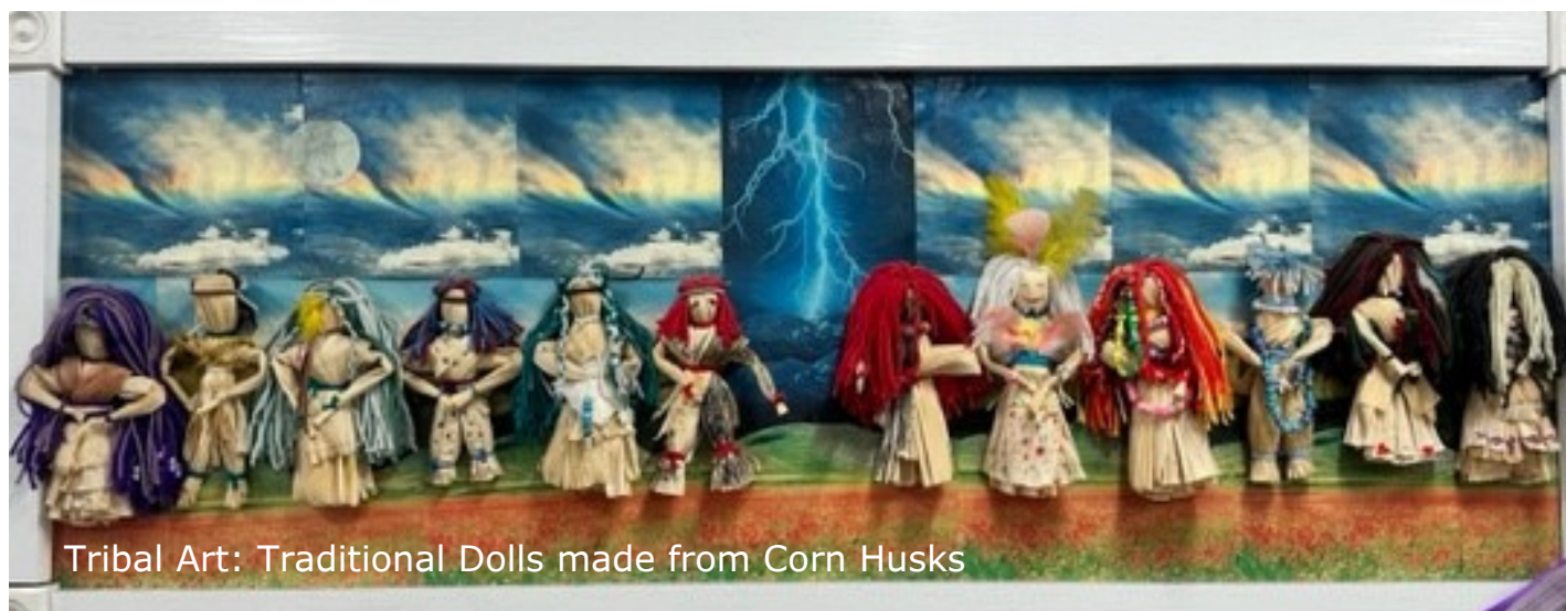
Tribal Art: Traditional Dolls made from Corn Husks